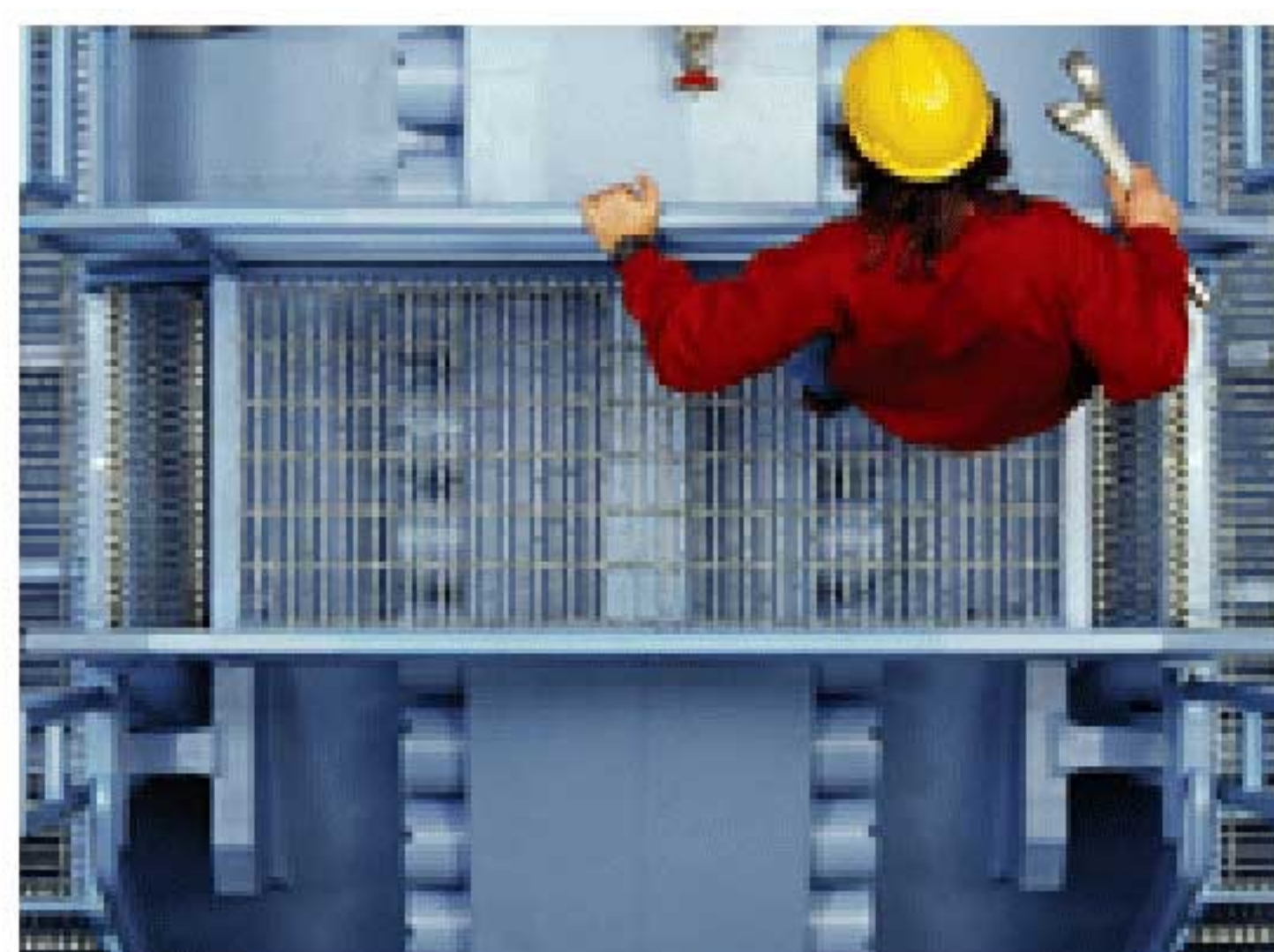
PLANT AUDIT & MAINTENANCE SERVICES